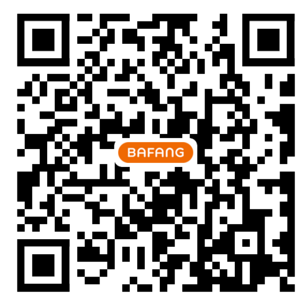
Scan the QR code to view a VR panorama of Bafang Laboratory Centers

It is foreseeable that with its high utilization rate and relevant industry qualification certification, the Bafang EMC Laboratory will accelerate a considerable reduction in costs related to EMC precompliance testing and components' CE certificating, and so, will truly achieve the company's "cost reduction" goal. In line with Bafang's commitment to creating advanced laboratory facilities, in addition to the EMC laboratory, the Bafang Laboratory Centers also feature spaces dedicated to Environmental Reliability, Battery, Mechanical Reliability, Aging, Acoustics and more. This large-scale, comprehensive laboratory structure ensures product stability and effectively improves the competitiveness of Bafang in the market.