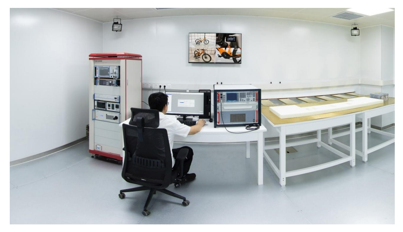
Bafang EMC laboratory

The Bafang EMC laboratory covers an area of about 120 m<sup>2</sup> and has both a Semi-Anechoic Chamber and an EM Shielding Chamber. The testing capabilities cover eBikes, civilian goods and components, and can fully meet the EMC testing requirements for motors, human-machine interfaces (HMIs), controllers, sensors, batteries, chargers and various other products.