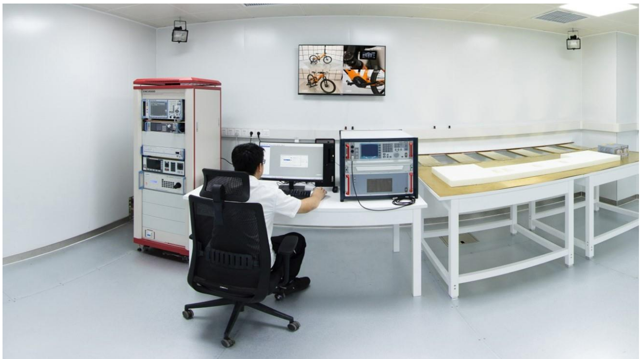
Bafang EMC laboratory, Photo: Bafang

The Bafang EMC laboratory covers an area of about 120 m 2 and has both a Semi-Anechoic Chamber and an EM Shielding Chamber. The testing capabilities cover eBikes, civilian goods and components, and can fully meet the EMC testing requirements for motors, human-machine interfaces (HMIs), controllers, sensors, batteries, chargers and various other products.